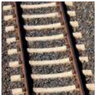
RAIL & TRANSIT INFRASTRUCTURE