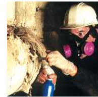
LEAD & ASBESTOS REMIEDIATION