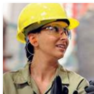
ENVIRONMENTAL HEALTH & SAFETY (EHS)