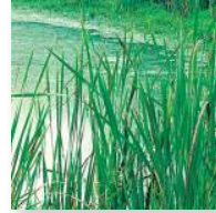
ECOLOGY NATURAL RESOURCES