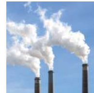
AIR QUALITY SERVICES MONITORING & SUPPORT