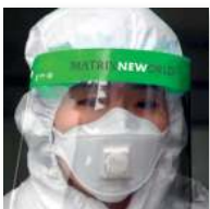
PATHOGEN REMIEDIATION SERVICES