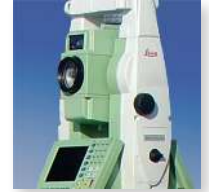
LAND SURVEYING & HD LASER SCANNING