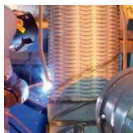
WELL DESIGN CONSTRUCTION & TESTING