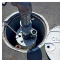
ENVIRONMENTAL SITE ASSESSMENT (ESA)