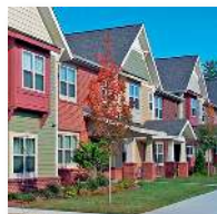
AFFORDABLE HOUSING DESIGN