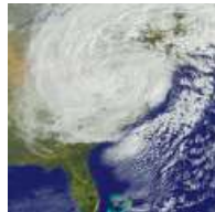
FLOOD HAZARD GRANT PROGRAM