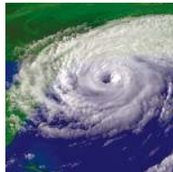
COASTAL RESILIENCY ENGINEERING