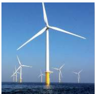
OFFSHORE WIND DEVELOPMENT SERVICES