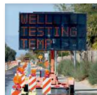
WELL DEVELOPMENT & TESTING