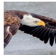
NEPA & STATE EQUIVALENT ASSESSMENTS