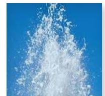
WATER SYSTEM ENGINEERING