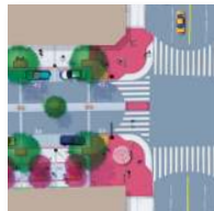
PLANNING FOR LAND DEVELOPMENT