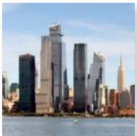
NYC ENVIRONMENTAL REVIEW (CEQR)