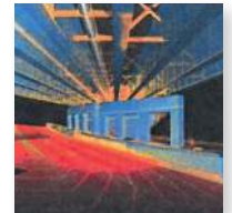
BIM & 3D MODELING SOLUTIONS