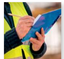
REGULATORY COMPLIANCE MONITORING